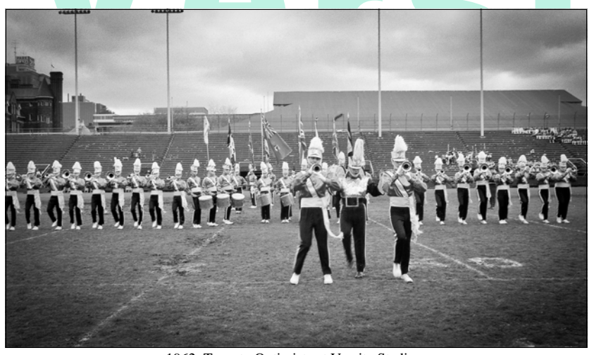
1962: Toronto Optimists at Varsity Stadium

The inside of the bus could become a haven for the vilest noises and exclamations known to man. These would be accompanied by the appropriate offensive odours, and the whole served to create a scenario that was not for those of delicate sensibilities. Any inclined this way would soon learn this. But nobody was ever physically injured, even though many fights took place. They were all in good fun. To the best of my knowledge, nobody ever quit the Corps because of the atmosphere on the bus. The later addition of girls to the Corps, it was noticed,