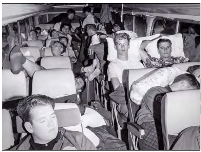
1963 or 1964: Travelling to Midwest

This lasted until everybody was exhausted, which often took a long time, young and healthy as we were. The bus driver took it all in stride, probably having seen worse if in the habit of driving weekend groups. It was all great fun and most times ended with us taking up a collection for the driver on the way home. In a Corps hat - remember those!