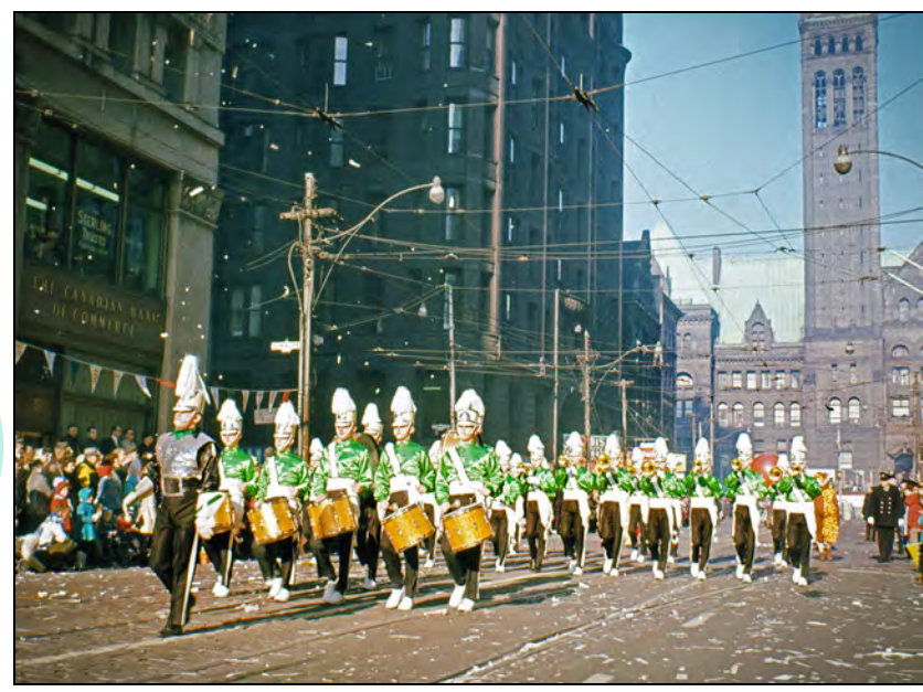
1962: Toronto Optimists in the Grey Cup Parade

The overall attraction, even addiction, that the Corps exerted on its members is best illustrated by events of today. Whenever reunions occur, formal or otherwise, after the first few minutes, all talk is of the Corps. Most of these people are successful, in the accepted fashion, in their latter day lives. Some are high ranking business executives, others business owners. Nearly all are solidly capable in some field or endeavour. Some have families, and some are now retired. No matter. Seldom meeting other than at arranged occasions, when they